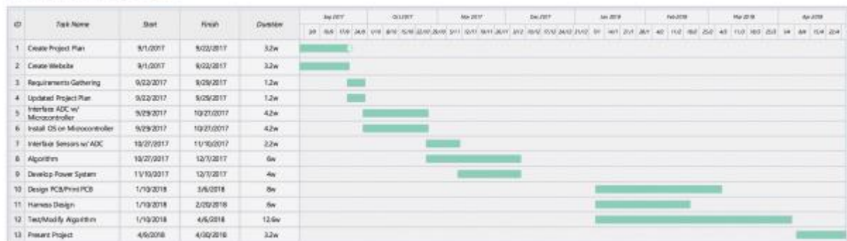
Pilot Biometrics Schedule